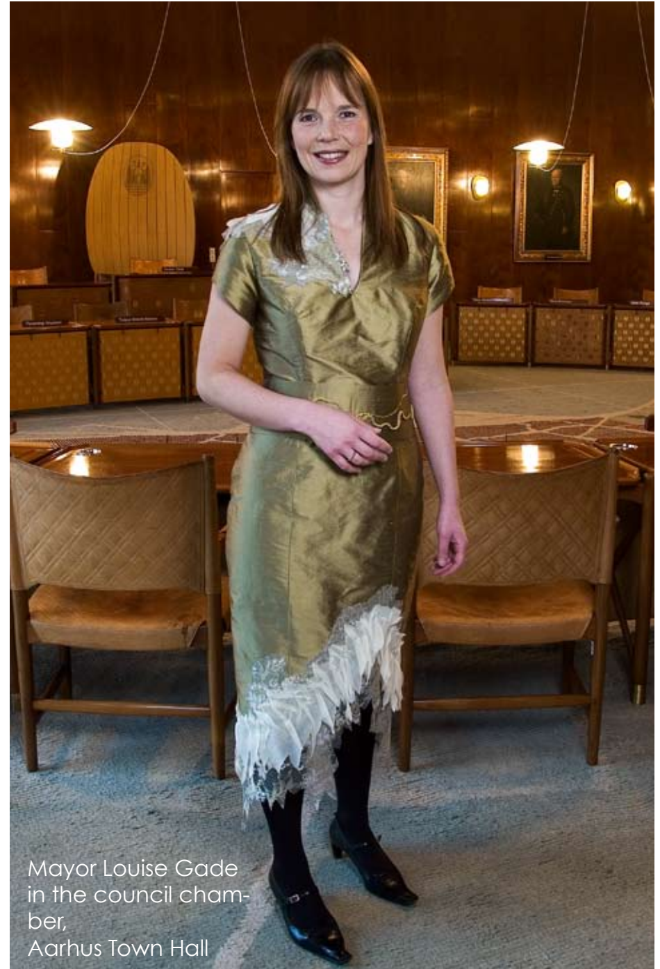
Mayor Louise Gade in the council chamber, Aarhus Town Hall