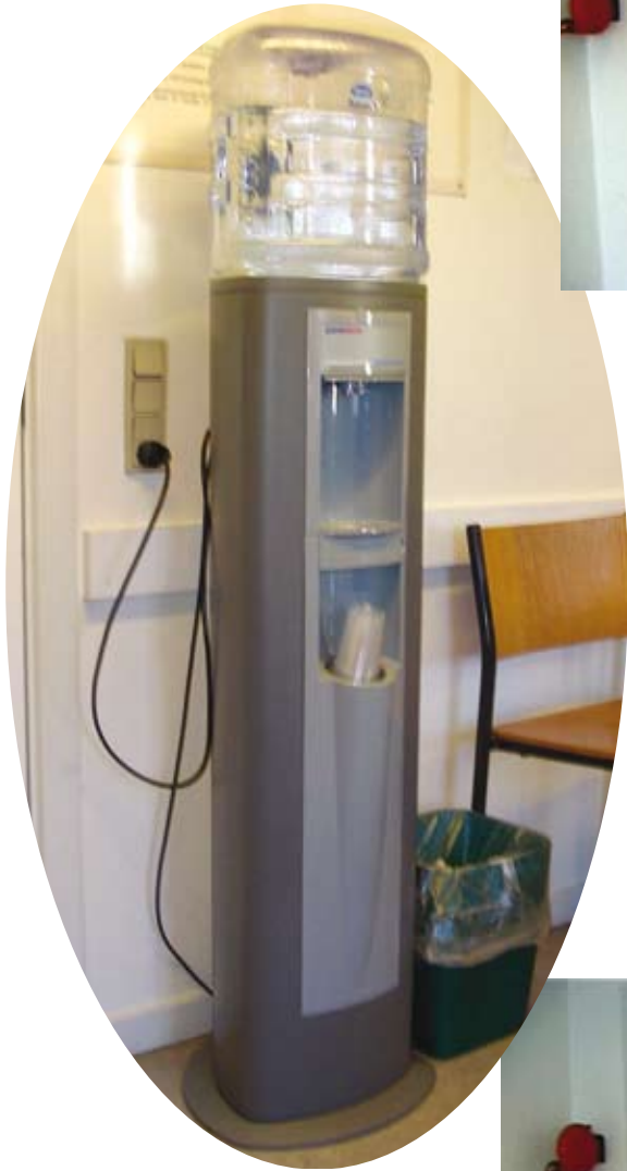
The drinking water automaton in the waiting room for immigrants on the police station.